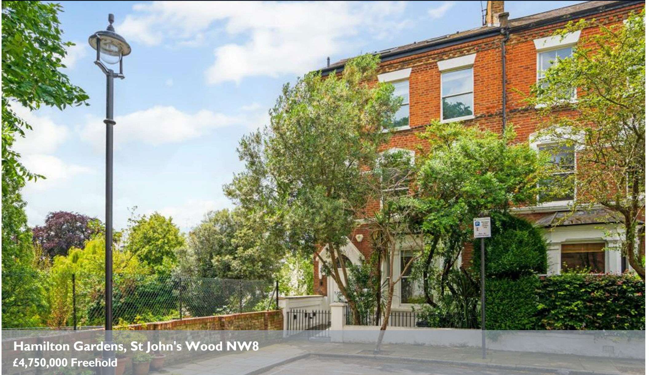
Hamilton Gardens, St John's Wood NW8 £4,750,000 Freehold